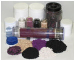
26 Different chemical filters

Information subject to change without notice